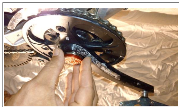
Pic.4: Grab All InMmultitool<sup>TM</sup>'s cap on the side with the fingertips in contact with the crank

Data Given the strength of the magnet, the first few times it may be difficult to extract All In Multitool<sup>TM</sup>, you should do the following (Pic.4, Pic.5):