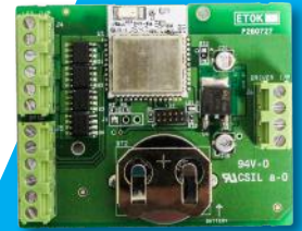
PWM for Multicolor Lighting & ON/OFF Device Control