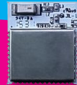
MeshTek™ H51/H52 module For BLE IoT application