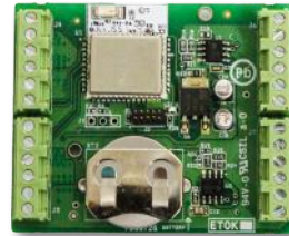
Dual 0/1-10V Controller Horticulture Lighting