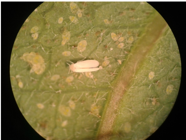
Bemisia whitefly lifestages on a poinsettia leaf