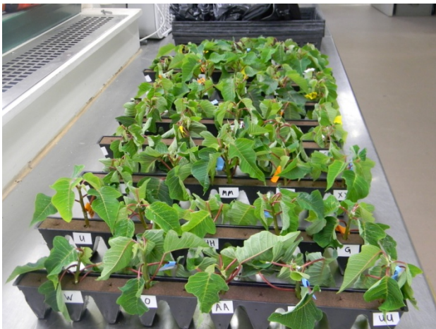
Dipped poinsettia cuttings ready to be placed under misting