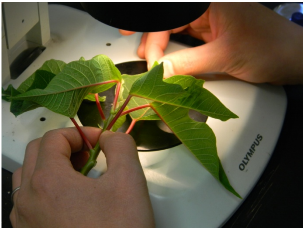
Counting whiteflies on a poinsettia cutting