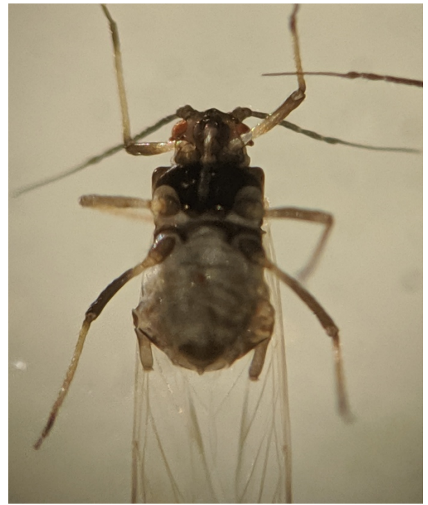
Figure 2: Ventral view of Rice Root Aphid ( R. rufiabdominale ) alate.

Due to government regulations, little if any literature has been published on the topic of rice root aphids in Cannabis . As such, many of the recommendations are from experience and observation. At Sound Horticulture, we have found the best way to avoid an infestation is to thoroughly inspect roots of incoming plant material and reject them if aphids are spotted. Also, make sure everyone in your facility is following good sanitation practices. Root aphids are not known to produce a persistent egg stage indoors in Cannabis , so a plant free period of one week between crop cycles should be sufficient to starve the aphids (Cranshaw, 2018).