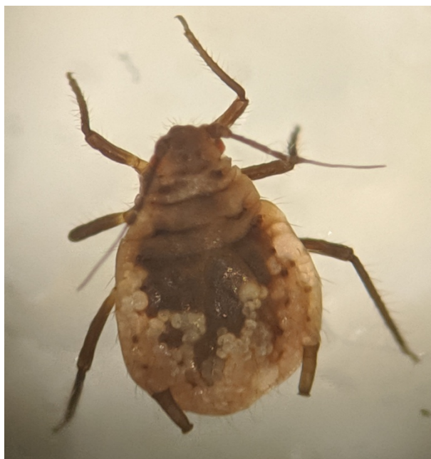
Figure 1: Dorsal view of Rice Root Aphid ( R. rufiabdominale ) aptera. Photograph by Alec Blume, 2019.

Coming from the same genus, rice root aphids ( R. rufiabdominale ) and cereal oat aphids ( R. padi ) look similar, though cereal oat aphids tend to have a hairier body and shorter setae on their antennae (Sunil and Poorani, 2018). Wingless (Fig. 1) and winged (Fig. 2) forms of root aphids are often present, but the winged forms will typically have darker coloration due to more sclerotization (hardening of exoskeleton) and will be present in the canopy. Keep a close eye on your yellow sticky cards as this can be an indication of their presence.