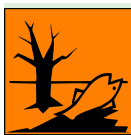
Dangerous for the environment