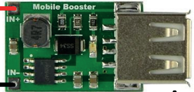
1.2A USB Output Step-Up