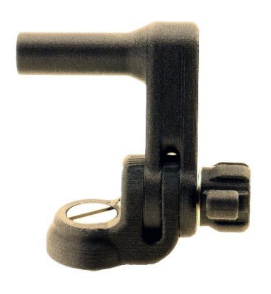
Motor Bracket MB12