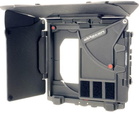
v1 Flags ergonomics