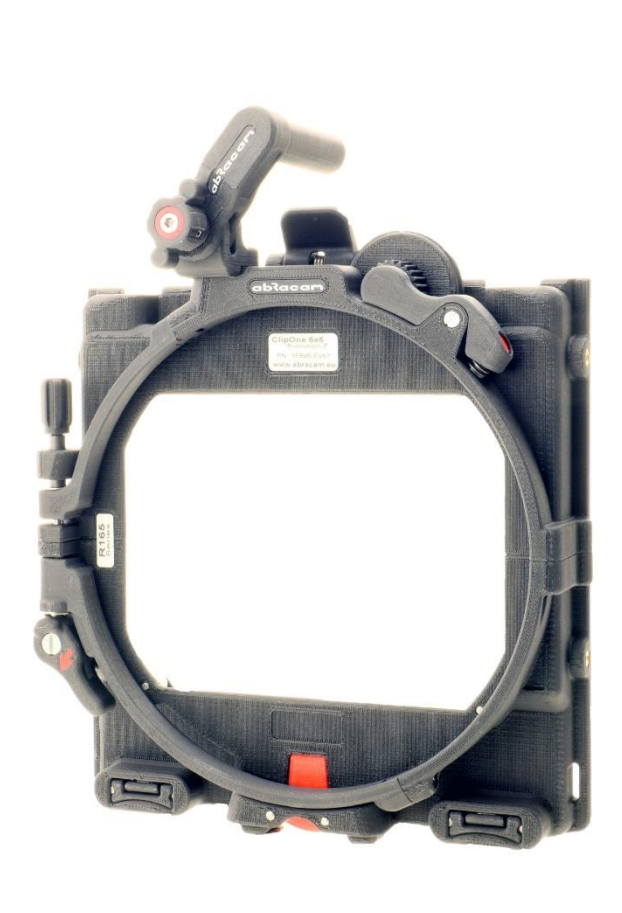
3F6x6 Shown with the Motor Bracket MB12

Motors: Heden, Arri, Cmotion... (30gr, 1oz)