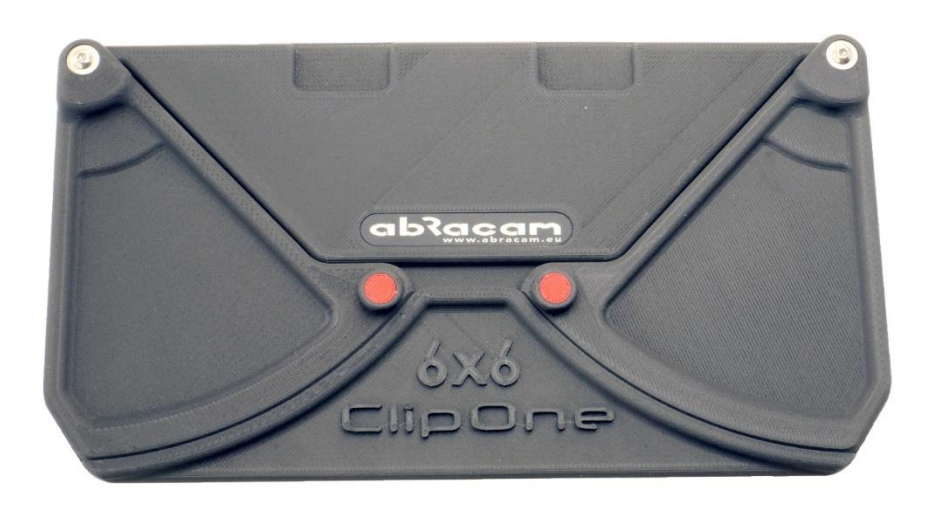
Top or bottom Flag TF-6x6