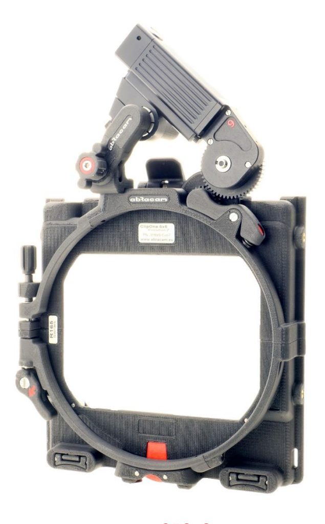
3F6x6 Shown with the Motor Bracket MB15 & M26VE Heden motor