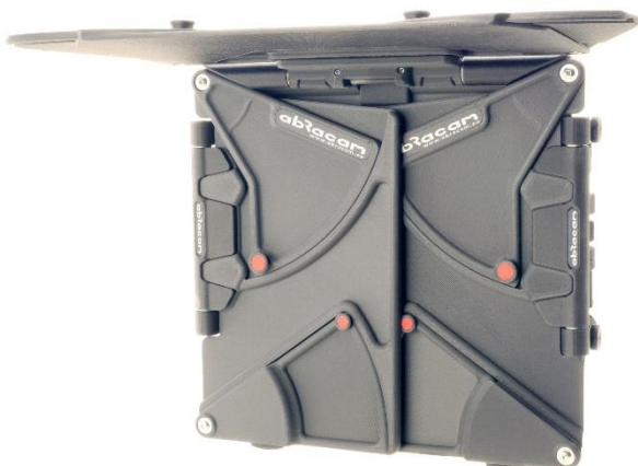
v2 Flags ergonomics