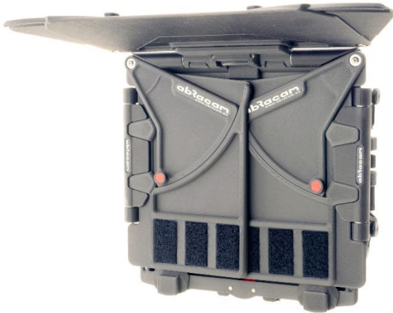
v1 Flags ergonomics