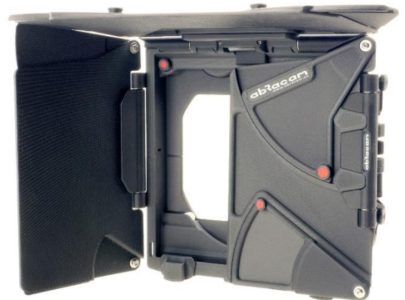
(Bottom Flag kit removed)