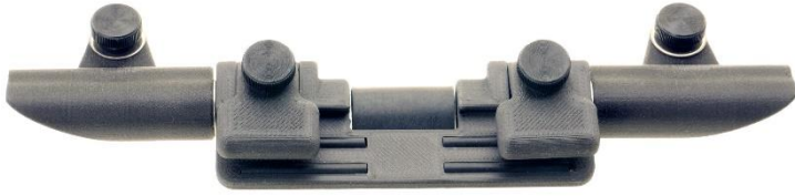
Top Flag Bracket