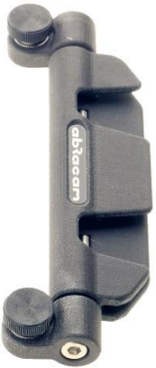
Side Flag Bracket