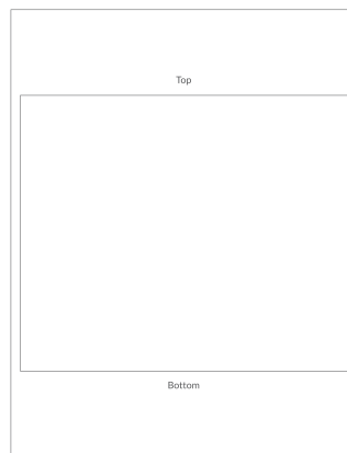
Hand/Foot Print Page