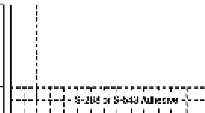
Fig. 3 Adhesive band.