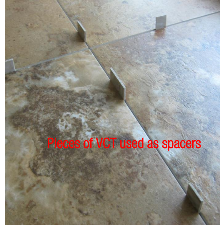
Pieces of VCT used as spacers