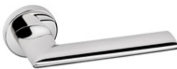
IN.00.240.P DYNAMIC Material: EN 1.4301 - Polido / Polished / Pulido RC08M - Roseta standard / Standard rose Design: Christian Magalhães