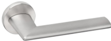
IN.00.240 DYNAMIC Material: EN 1.4301 - Satinado / Satin / Satin RC08M - Roseta standard / Standard rose Design: Christian Magalhães