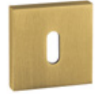
IN.04.29Q.P09.M.TG Satinado / Satin / Satin IN.04.29Q.P09.MP.TG Polido / Polished / Pulido Material: EN 1.4301 + TITANIUM - Gold