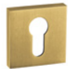
IN.04.29Q.Y09.M.TG Satinado / Satin / Satin IN.04.29Q.Y09.MP.TG Polido / Polished / Pulido Material: EN 1.4301 + TITANIUM - Gold