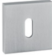
IN.04.29Q.P09.M QUADRO IN.04.29Q.P09.MP QUADRO Material: EN 1.4301 - Satinado / Satin / Satin Entrada de chave normal / Key hole for normal key / Bocallave para llave normal.