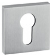
IN.04.29Q.Y09.M QUADRO IN.04.29Q.Y09.MP QUADRO Material: EN 1.4301 - Satinado / Satin / Satin Entrada para cilindro europeo / Key hole for european cylinder / Bocallave para bombillo europeo.