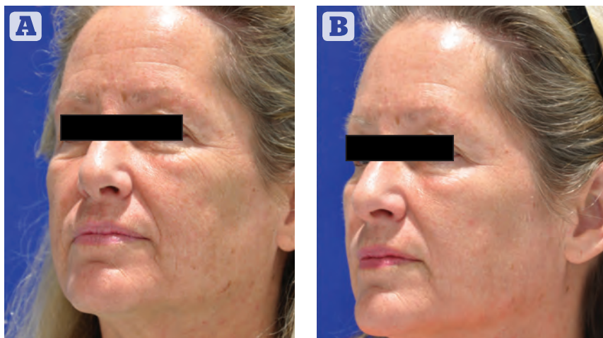
Figure 2 Daily Skincare Result: Restorative Skin Complex and Restorative Eye Treatment, Baseline and 6 weeks