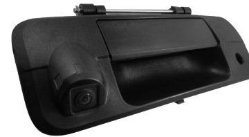
Tailgate door handle camera for Toyota Tundra 2007~2013