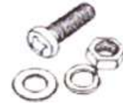
C. Screw x2