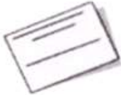
D. User's manual x 1