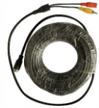
65ft Extension Cable