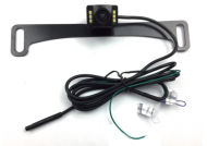
Control Wires Blue Loop: cut = turns off trajectory lines White Loop: cut = display non-mirror images Green wire: connect to reverse backup light positive = LED will turn on whenever backup light is on.

** Monitor trigger ** when reverse backup light comes on it will trigger the monitor to switch to backup camera.