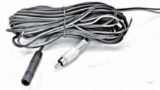
24ft mini 4-pin wire harness(1pcs)