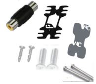
Screw x2(KM6X24) Screw x2(Pm3x10X7) Screw x2(Pm2.5x8) Conversionconnectorx1 Bracketx1 3M double stickerx1