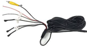
Video / Power Extension