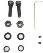
Hex Wrench / Spare Hex Bolts License Plate Bolts and Nuts