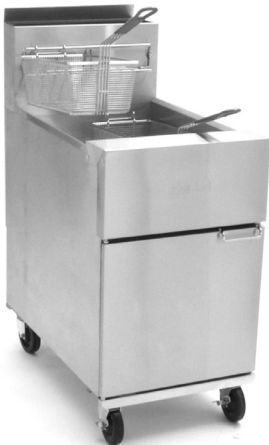
SR162G Shown with optional casters.