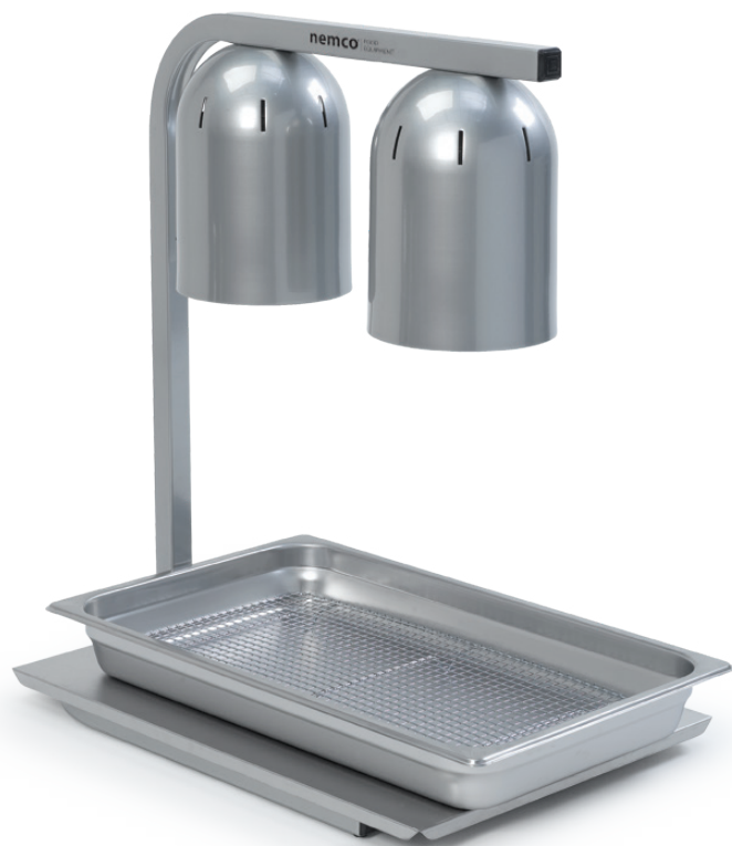
Model 6000A-2, shown with optional 66091 and 66089.