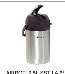
AIRPOT, 2.5L SST LA 6/ CASE