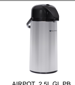
AIRPOT, 2.5L GL PB SINGLE PK