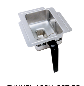
FUNNEL ASSY, SST-PP BLK HNDL