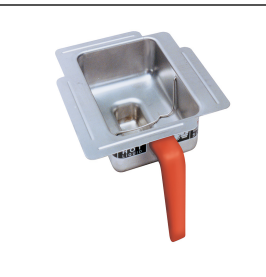
FUNNEL ASSY,SST-PP ORANGE HDL