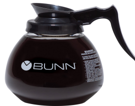
DECANTER, GLASS-BLK 12C 3/CS