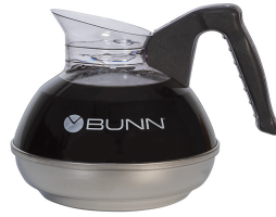
EASY POUR®,(BLK) 3/CS