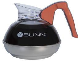
EASY POUR®,(ORN) 2/CS