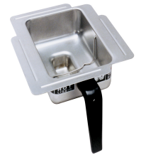
FUNNEL ASSY, SST-PP BLK HNDL