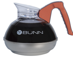
EASY POUR®,(ORN) 3/CS