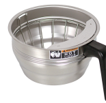
FUNNEL ASSY, SST-BLK HDL(7.12)