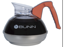
EASY POUR®,(ORN) 24/CS