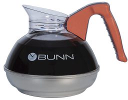
EASY POUR®,(ORN) 1/CS