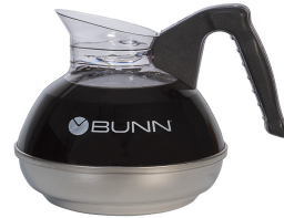
EASY POUR®,(BLK) 6/CS