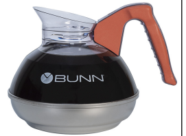
EASY POUR®,(ORN) 24/ CS