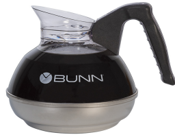
EASY POUR®,(BLK) 2/CS