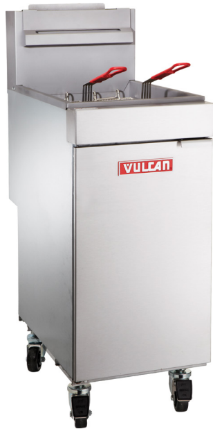
Model LG300 Shown with caster accessories