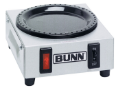
STOVE, WX1 120V/100W