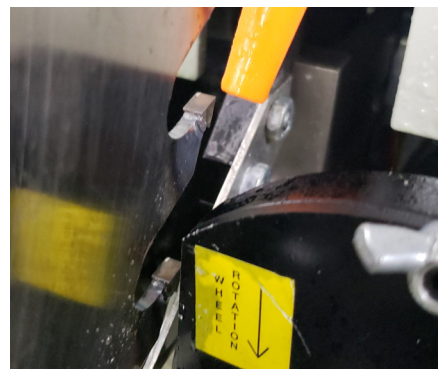
The DS-4 delivers symmetric cutting angles with simple adjustments.

DS-4 Dual Side Sharpener 2305