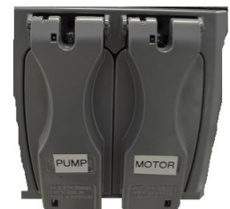
Dual On/Off Switches