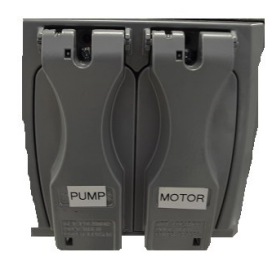
Dual On/Off Switches