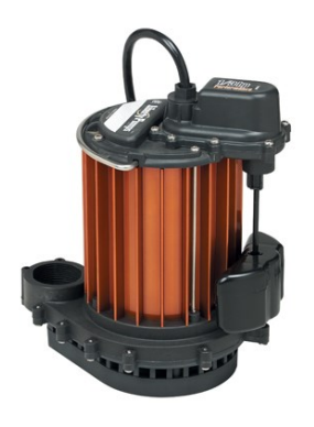
1/3HP Sump Pump Model 237-VMF