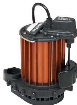
1/3HP Sump Pump Model 237-VMF