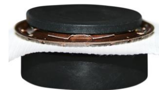
22-GSP12-1 Grommet Setter

Fits our #12 EZ Set Metal and #10 Two Sided Plastic Grommets.