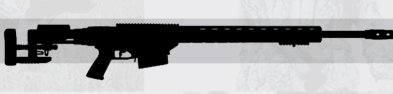
Typical Ring Heights used: MSR only (occasionally the handguard/barrel contour may allow the use of Medium)

Rifles with no drop in the stock, with the cheek rest directly in line with the top of the action, such as AR15/AR10 require a higher scope mount for the shooter to get a proper cheek weld. The only suitable ring height is the MSR height.