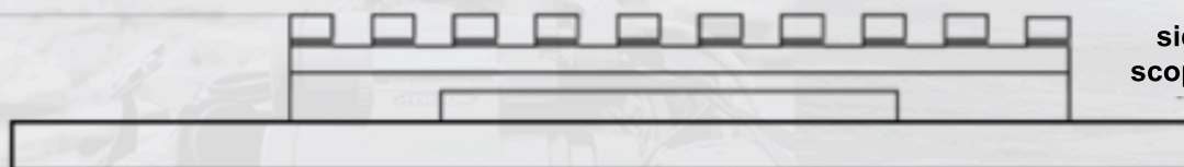
side view scope mount