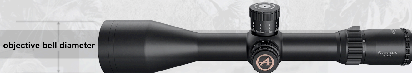
side view of scope