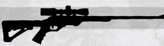
Typical Ring Heights used: Low-Medium