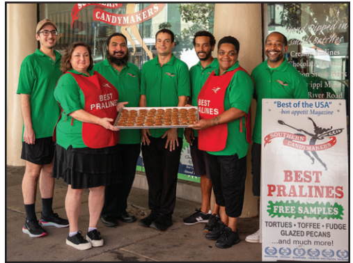
1010 Decatur location

With an enthusiastic customer base behind us and encouraging feedback, we aimed our sights on developing a satellite store in the heart of the French Market in the fall of 2001. Here we practice the same old-fashioned, candy-making traditions and are excited to have customers sample our creations. This location has become an anticipated stop for visitors and locals alike and we couldn't be happier amongst the jazz bands and the fruit stands of the French Market.