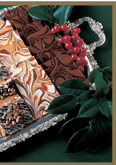
Road, Tiger Bark, Mississippi Mud