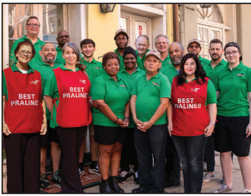
334 Decatur location