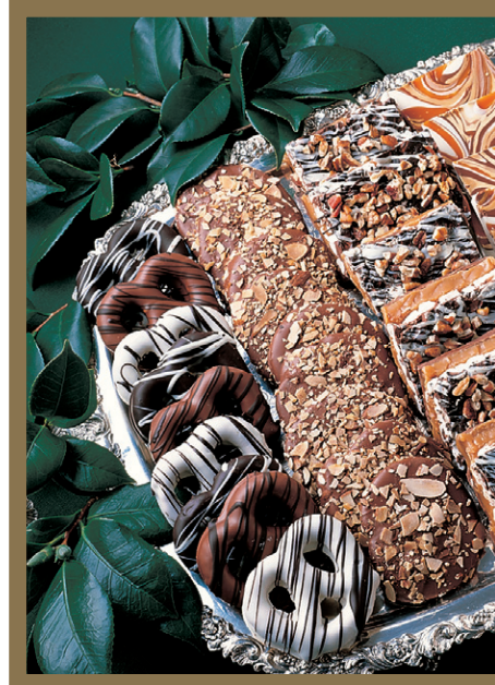
Pretzels, Almond Toffee, Rocky River