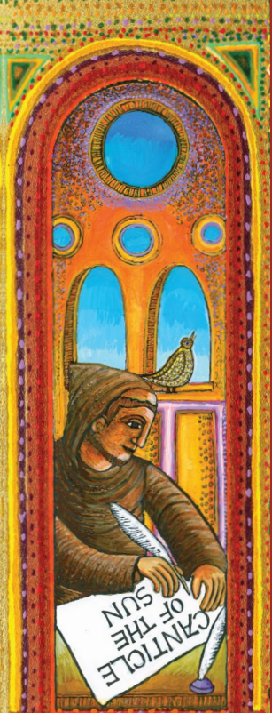
FRANCIS COMPOSES A SONG OF PRAISE