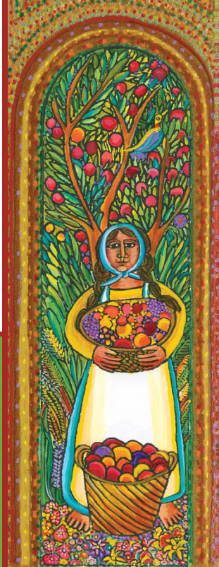
OUR SISTER, MOTHER EARTH