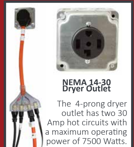
NEMA 14-30 Dryer Outlet

The 4-prong dryer outlet has two 30 Amp hot circuits with a maximum operating power of 7500 Watts.