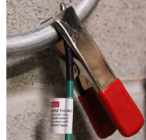
(2) Securing the ground pin using a heavy-duty metal clamp

2. If a household outlet is unavailable, you can ground your equipment using a heavy-duty metal clamp (not included), just clamp the grounding pin to a nearby metal pipe.