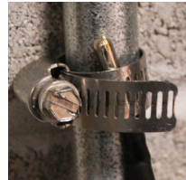
(3) Use an adjustable galvanized hose clamp.

3. You can also use an adjustable galvanized hose clamp (Not Included) to attach the grounding pin to a nearby metal pipe. Use a screw driver to tighten the clamp over the pin.