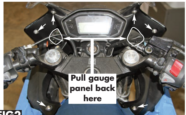
FIG2 Removing gauge panel and disconnecting gauge

Fig 1. The most helpful tool to have is a 5mm LONG ROUND end hex key with an extension. This one tool will take off all the necessary bolts to perform the removal & install. Loosen both mirrors. Be careful not to drop the mirrors. Apply blue painter's tape to the upper inner forward fairing behind the windscreen, such as the tank and side cowling panels, to protect it during the gauge panel's removal and installation process.