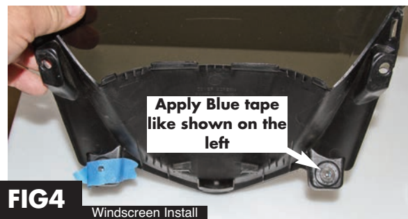
FIG4 Windscreen Install

Use Caution: Pulling the screen forward, the screen is fragile and will break off if applied with heavy pressure.