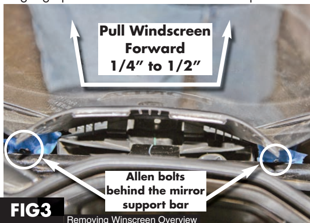
FIG3 Removing Windscreen Overview

Use Caution: Pulling the screen forward, the screen is fragile and will break off if applied with heavy pressure.