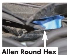
Allen Round Hex

Fig 3. Pull the windscreen forward just enough to insert the round end hex key (use caution) to the two windshield Allen bolts behind the metal rod that supports the mirrors. The ROUND end hex key will be the tool to remove these bolts out. Remove Windscreen.