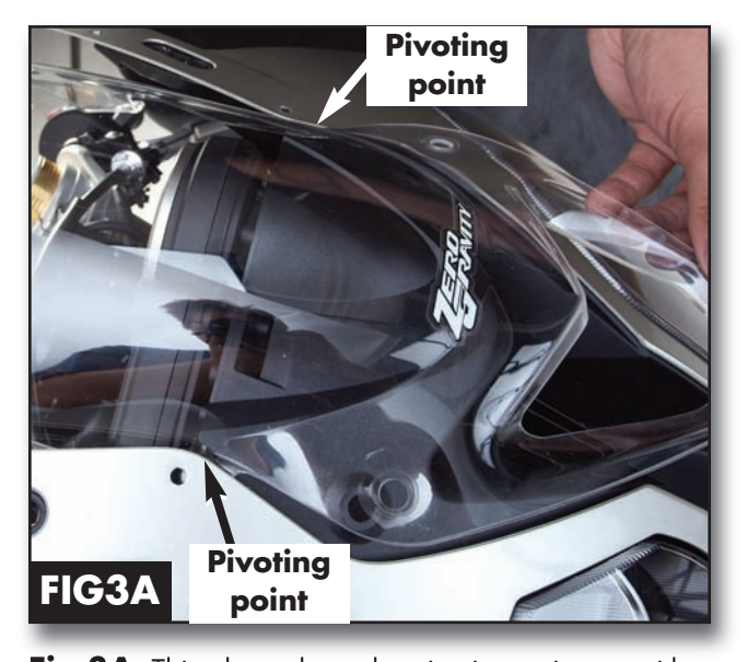
Fig 3A. This photo shows he pivoting points on either side of the screen. Be careful not to over pivot!