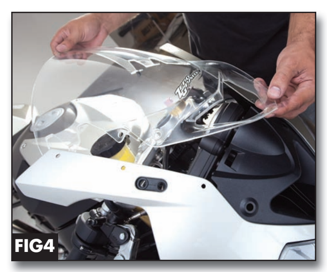
Fig 4. Now you are ready to remove the screen. Slide the windscreen back to remove.