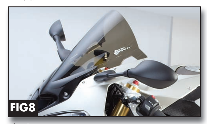
Fig 8. Windscreen and Mirrors installed.

Please see www.zerogravity-racing.com for further information concerning this product.