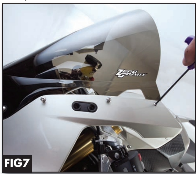
Fig 7. Starting from the top of the windscreen and working down, hand tighten all fasteners then reinstall mirrors.