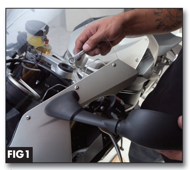
Fig 1. Remove both mirrors. The fasteners are behind the fairing. Be careful not to drop the mirrors!

Helpful hints: Use metric tools, clean hands, put the bike on a stand. Do not pry on the screen excessively, as it can break without much warning.