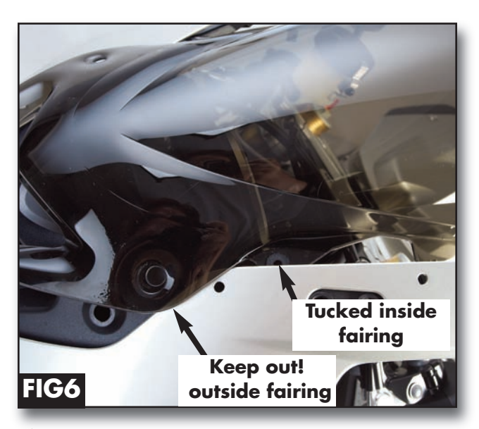
Fig 6. Install screen from the back side. Reclined in position, the front of the windscreen should be on the outer side of the fairing with the wellnut tab tucked inside fairing.