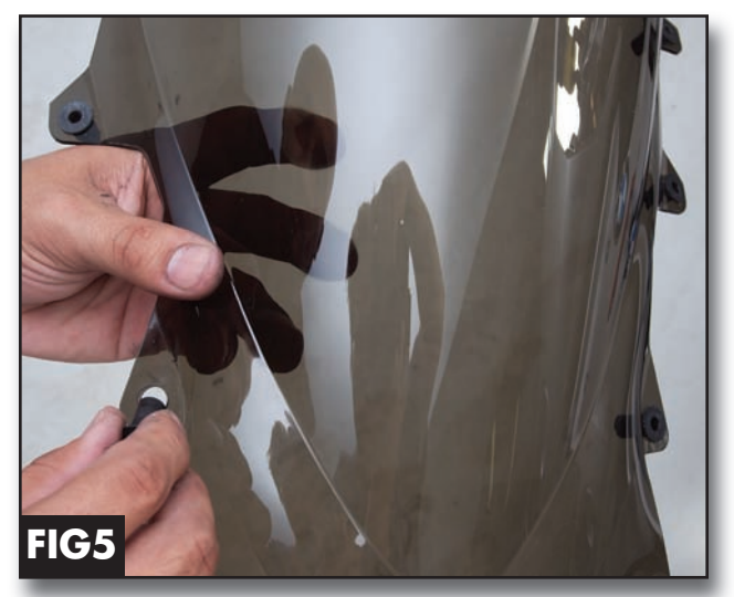
Fig 5. Before installing Zero Gravity Windscreen. Install Rubber wellnuts (Remove them from your stock screen).