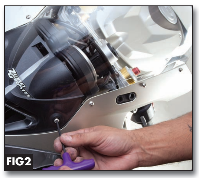
Fig 2. Remove all 8 fastener screws.