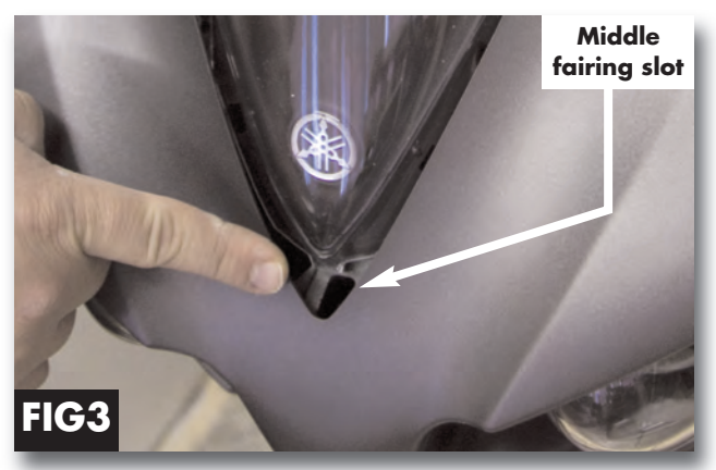
Fig 3. Locate the middle fairing slot at the bottom of the windscreen. Insert windscreen into this slot for positive retention.

Fig 1. Remove both mirrors. Locate both fasteners in the inside fairing. Once you remove the mirrors the factory screen can be removed by sliding back and pulled up slightly. For 2012 - 2014 install: OEM windscreens have an inner plastic mold attached to the screen (as shown above). Carefully remove it and attach to Zero Gravity screen as shown in Fig 1.