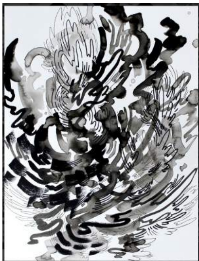
270 Million Project #199, 2021