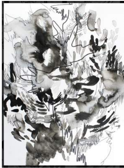
270 Million Project #9, 2020