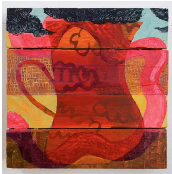
moo spirit vessel , 2020 Raymond Hwang Acrylic on canvas 12 x 12 inches