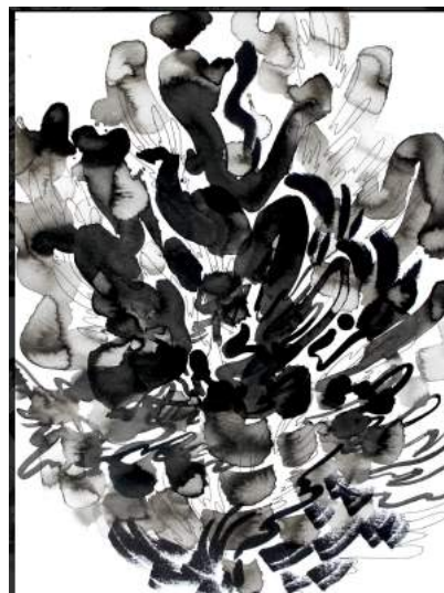
270 Million Project #201, 2021