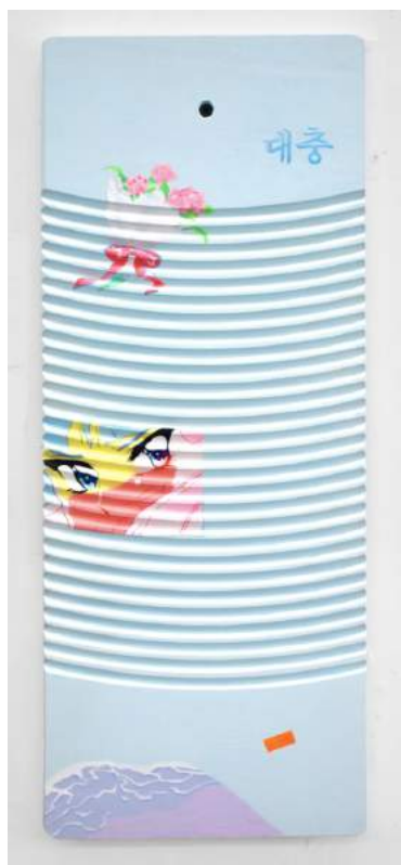
Meh, clean your laundry and get married, 2019 Christina Yuna Ko Acrylic on washboard 8 x 19 5/8 inches