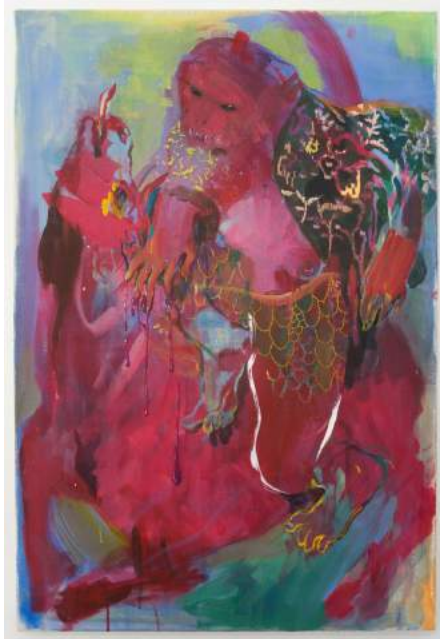
牛魔王, 2019 Jia Sung Acrylic, embroidery thread, and glass beads on canvas 24 x 36 inches