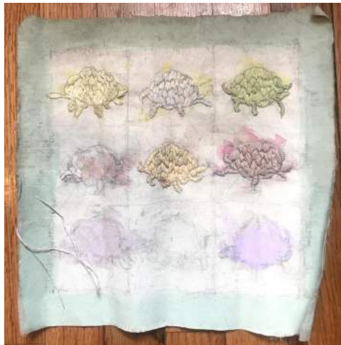
8 chrysanthemums , 2021 Jia Sung Gouache and embroidery thread on unstretched linen 12 x 12 inches

Special thanks to our friends at Chelsea Market, New Project, LLC , Marino PR, Pearl River Mart Foods, and all of the participating artists.