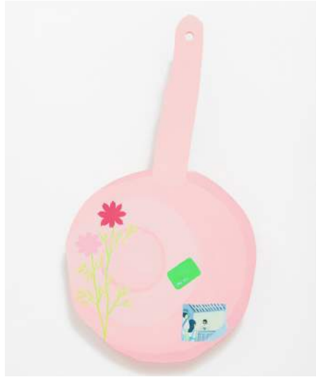
Jaru Ba Goo Nee , 2020 Christina Yuna Ko Acrylic on MDF 7 x 13 inches