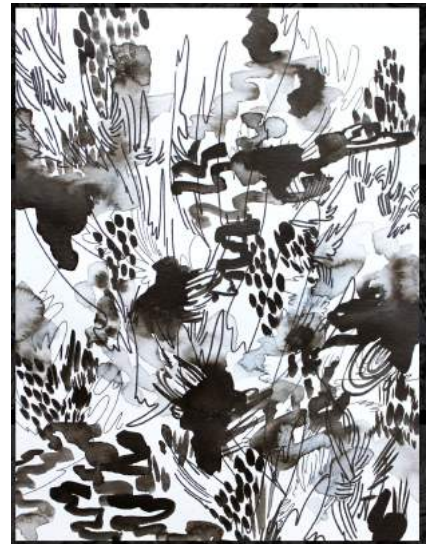
270 Million Project #19, 2020