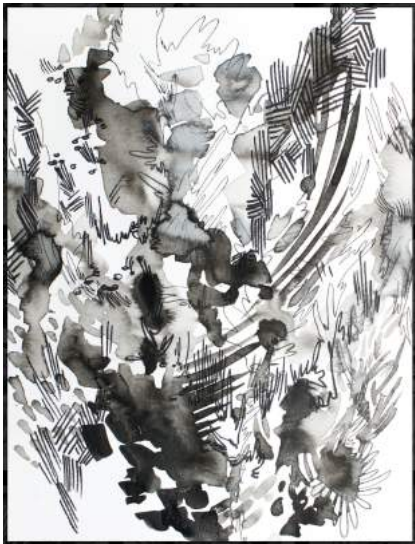
270 Million Project #8, 2020

($100 from the sale of each work goes to Legacies of War or COPE.org)