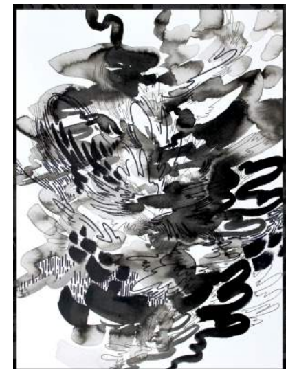
270 Million Project #203, 2021