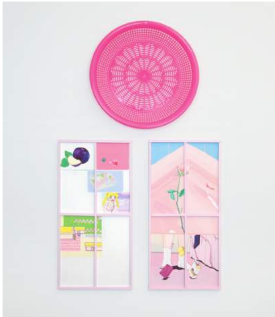
Plastic Tumblr Stained Glass Windows, 2016 Christina Yuna Ko Acrylic on MDF, balsa wood, and plastic tray 29 x 45 inches