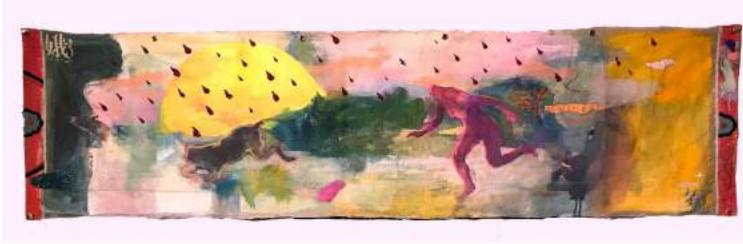
apocalypse hymn (dou'e yuan) , 2021 Jia Sung Gouache, acrylic, embroidery thread, grommets, and glass beads on linen 16 x 60 inches