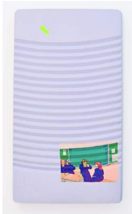
Laundry School Uniform, 2020 Christina Yuna Ko Acrylic on washboard 7 x 11 3/4 inches