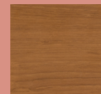
ASIAN GOLDEN TEAK