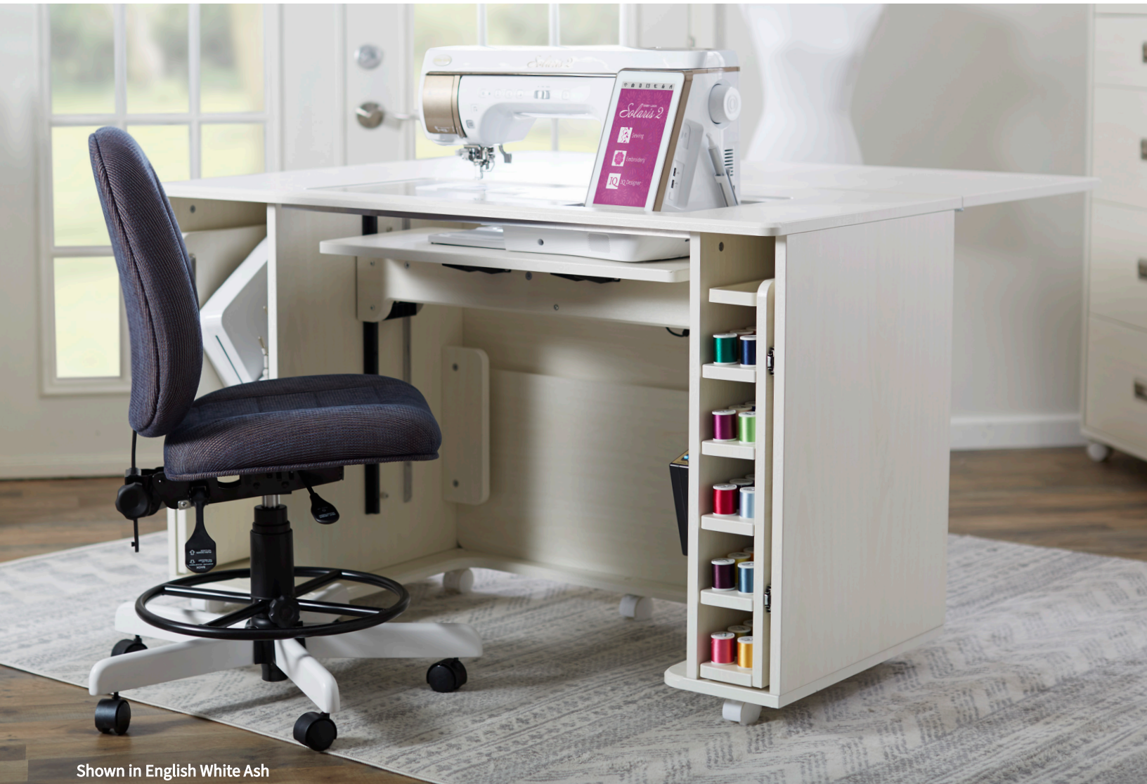
Shown in English White Ash

Fine Sewing Furniture — Crafted for You —