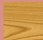
NORTH AMERICAN OAK