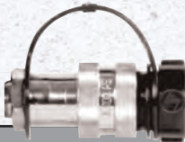
High-Flow Coupler:CH38F Included on all models