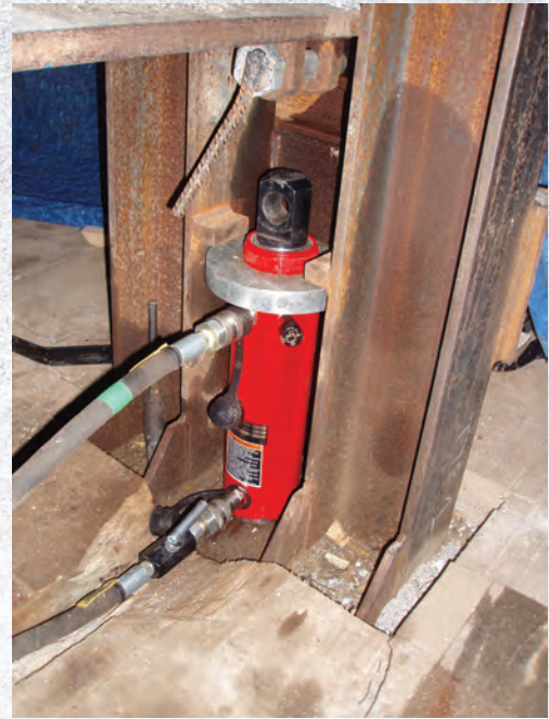
HD cylinders can be used in pushing and pulling applications