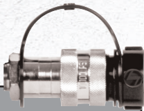
High-Flow Coupler:CH38F Included on all models