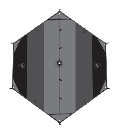
Deep Creek Tarp Medium Top View