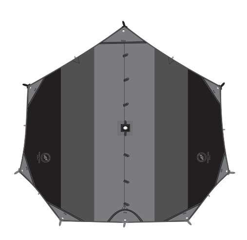
Deep Creek Tarp Large Top View