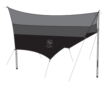
Deep Creek Tarp Medium