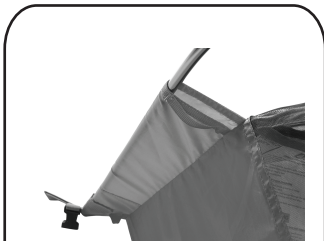
"Quick Corner" fabric sleeves

Insert poles tip into "Quick Corner" fabric sleeve, flex pole and insert the pole tip into opposite Quick Corner. Then repeat for the second pole. Tip: Please ensure each pole is fully seated within each Quick Corner sleeve.