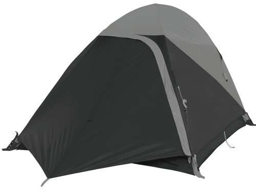
Grand Mesa 2 shown

In order to familiarize yourself with your new tent, we recommend you "test pitch" before your first adventure. For additional information please visit www.kelty.com .