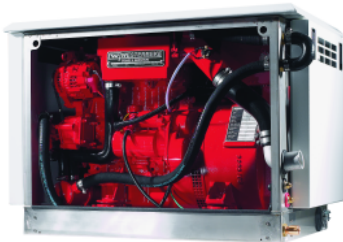
PN 49483 Sound Guard SST shown in all images. Location of some features may vary on other models.