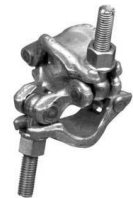
RIGHT ANGLE CLAMP Part #: C183

Specifications -53"L 1-7/16"OD -12 lbs -Powder Coat Finish