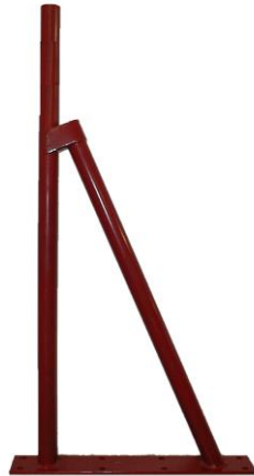
ANCHORE BRACKET Part #: 20317

Specifications -5'H x 12"W x 12" D -88 lbs -Alignment Guides -Powder Coat Finish