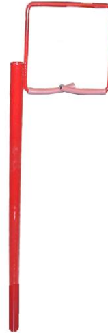
CABLE GUIDE Part #: B11521A

Specifications -48-3/4"L 1-7/16"OD -4" x 24" Mounting Plate -8 x 5/8" Tie In Holes -27 lbs -Powder Coat Finish