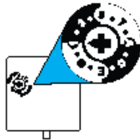
flight profile adjustment dial. Profile "1" selected.

If you find the Nanovario to be too chatty, you can disable the lift band by selecting profile 1, 5, A or E.