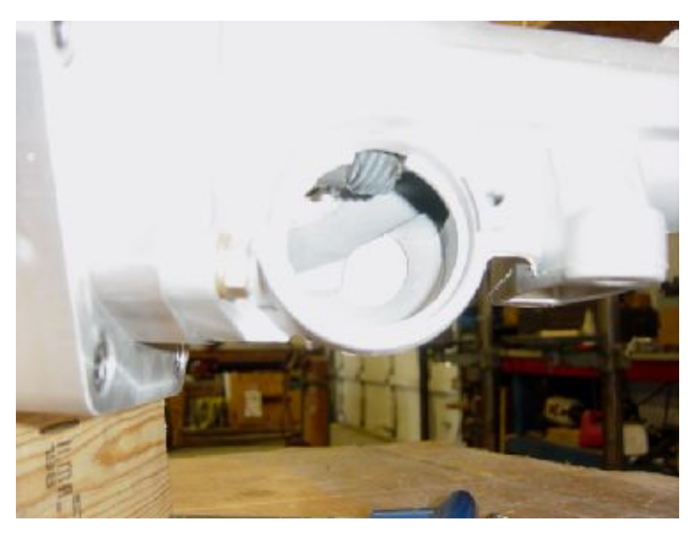
Install tail housing onto adapter with 4 bolts and tighten. Position reluctor/drive gear assembly, so that drive gear is in the center of speedometer sleave opening.

Slide reluctor/drive gear assembly onto output shaft. Do not tighten/set screws. Approximate reluctor/drive gear assembly, so that drive gear is in the center of speedometer sleave opening.