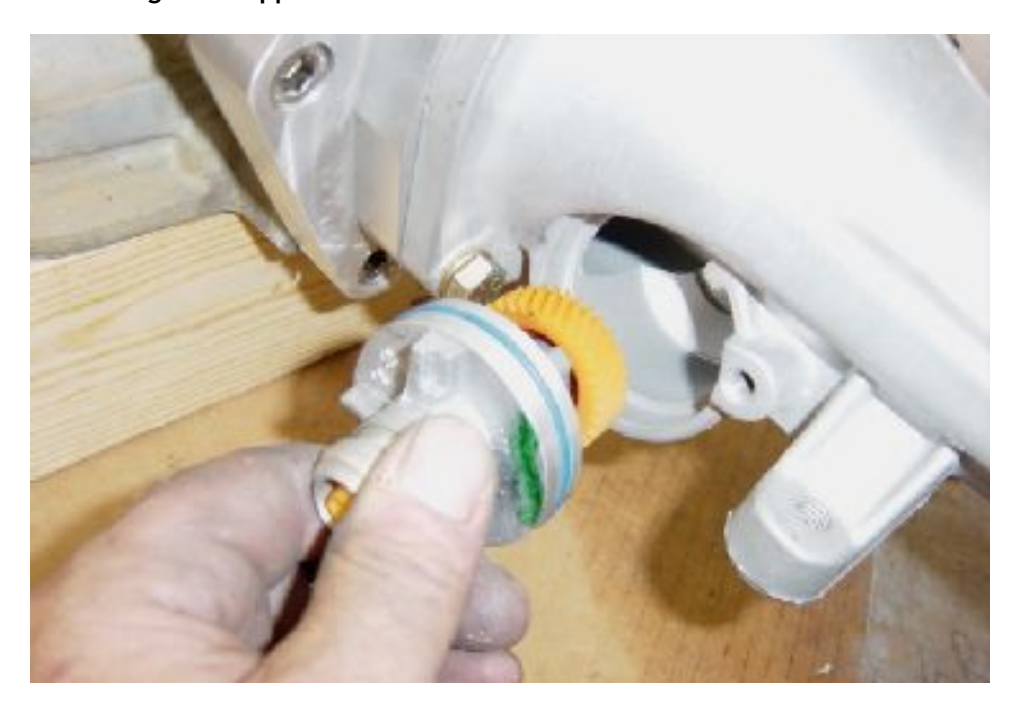
Remove speedometer sleave clamp and install sleave. Install clamp, taking care to position sleave so clamp tangs fit into the sleave properly. Hook-up VSS sensor and mechanical speedometer cable.