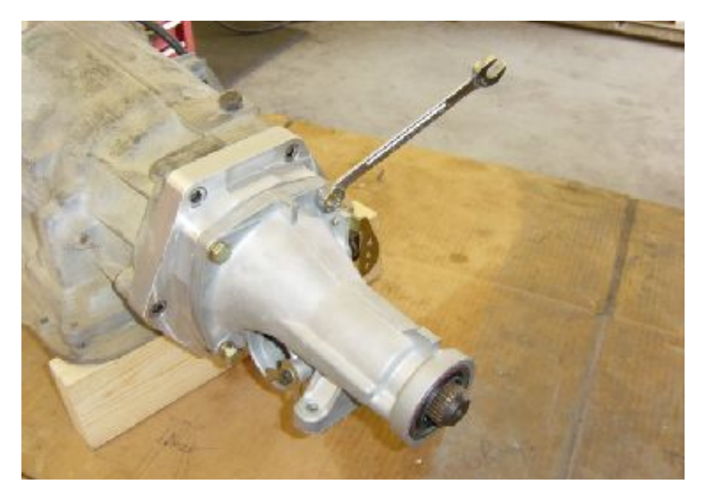
Install tail housing with supplied four bolts.

Loosen 4 tail housing attachment bolts and remove tail housing. Take care not to move reluctor/drive gear assembly while removing tail housing. Use Loctite 242 on the three set screws and tighten until secure.