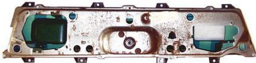
Back of standard dash

Both of the above show the backs of a standard dash and the gauges dash.