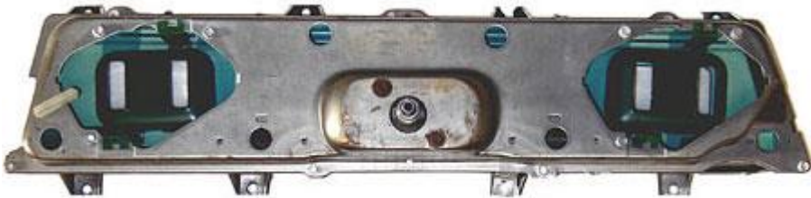
Back of gauges dash